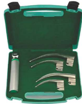
Mc-Intosh Laryngoscope Set of Fiber Optic Halogen Illumination Manufactured From: AISI 304 Stainless Steel Material